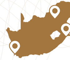
JOHANNESBURG, DURBAN AND CAPE TOWN, SOUTH AFRICA