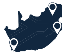
JOHANNESBURG, DURBAN AND CAPE TOWN, SOUTH AFRICA