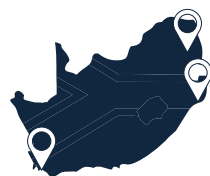
MBOMBELA, DURBAN AND CAPE TOWN, SOUTH AFRICA