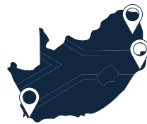
MBOMBELA, DURBAN AND CAPE TOWN, SOUTH AFRICA