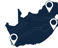
JOHANNESBURG, DURBAN AND CAPE TOWN, SOUTH AFRICA